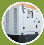
Inverter Power Backup