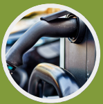
Electric Vehicle Charging Point