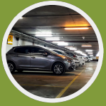
Covered Car Parking