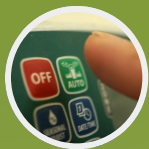
Semi Automatic Water Controller