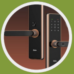
Biometric Main Door Lock