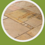
Cooling Lime Tiles at Terrace