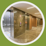
Lift with ARD Device