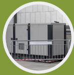
Genset with ATS Device