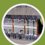
EB Panel Board