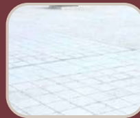
COOLING LIME TILES AT TERRACE