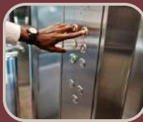
LIFT WITH ARD DEVICE