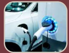
ELECTRIC VEHICLE CHARGING POINT