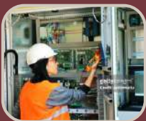
EB PANEL BOARD