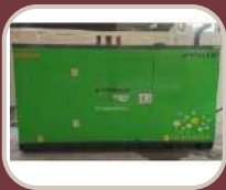
GENSET WITH ATT DEVICE