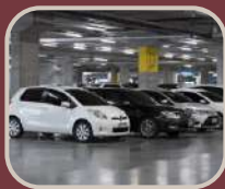
COVERED CAR PARKING