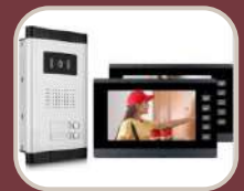
VIDEO DOOR PHONE