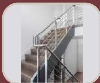
SS HANDLE FOR STAIRCASE