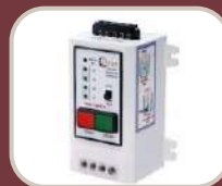
SEMI AUTOMATIC WATER LEVEL CONTROLLER