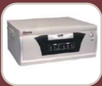
INVERTOR POWER BACKUP